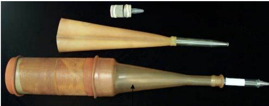
AV USED IN CATTLE, DOG AND CAT

Several methods of obtaining semen have been developed. Artificial vaginas (AV) are used to collect semen from many species, most prominently cattle and horses, but also sheep, goats, rabbits and even cats. An AV uses thermal and mechanical stimulation to induce ejaculation. An AV is composed of a tube with an outer rubber lining that hold water, into which is placed an inner liner that is lubricated just prior to use. The outer liner is filled and pressurized somewhat with water at 42-48 degrees Celsius.