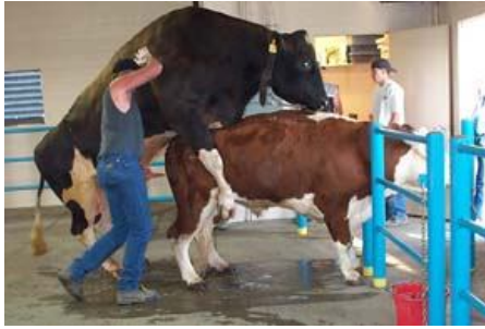
A: Fausle mounting