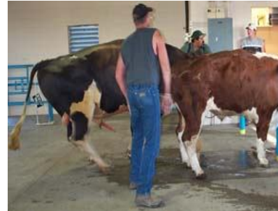
B: Sustained erection