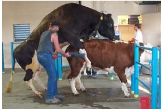
C: Diversion of penis into AV