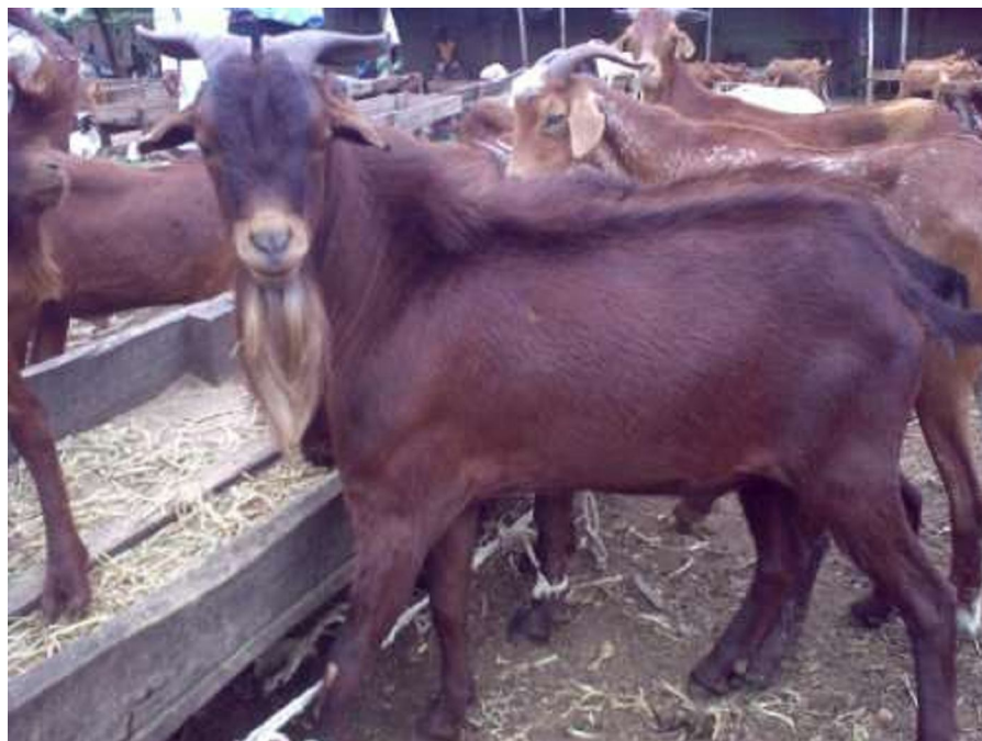
Plate 1. Maradi goats

One hundred and thirty eight unrelated individual goats from two different breeds: Maradi (Mar) a Northern breed, West African Dwarf (WAD) a Southern (Forest zone) breed and crossbreeds of both were used to estimate the allelic frequencies of each microsatellite.