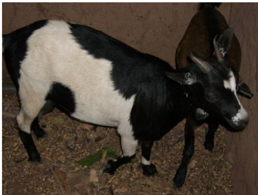
Plate 2. West African Dwarf goats

The selection was random with at least 100km distance between selection points to maintain sampling of unrelated animals. DNA was prepared from 7ml blood collected into vacutainer tubes, from the jugular vein of the animals.