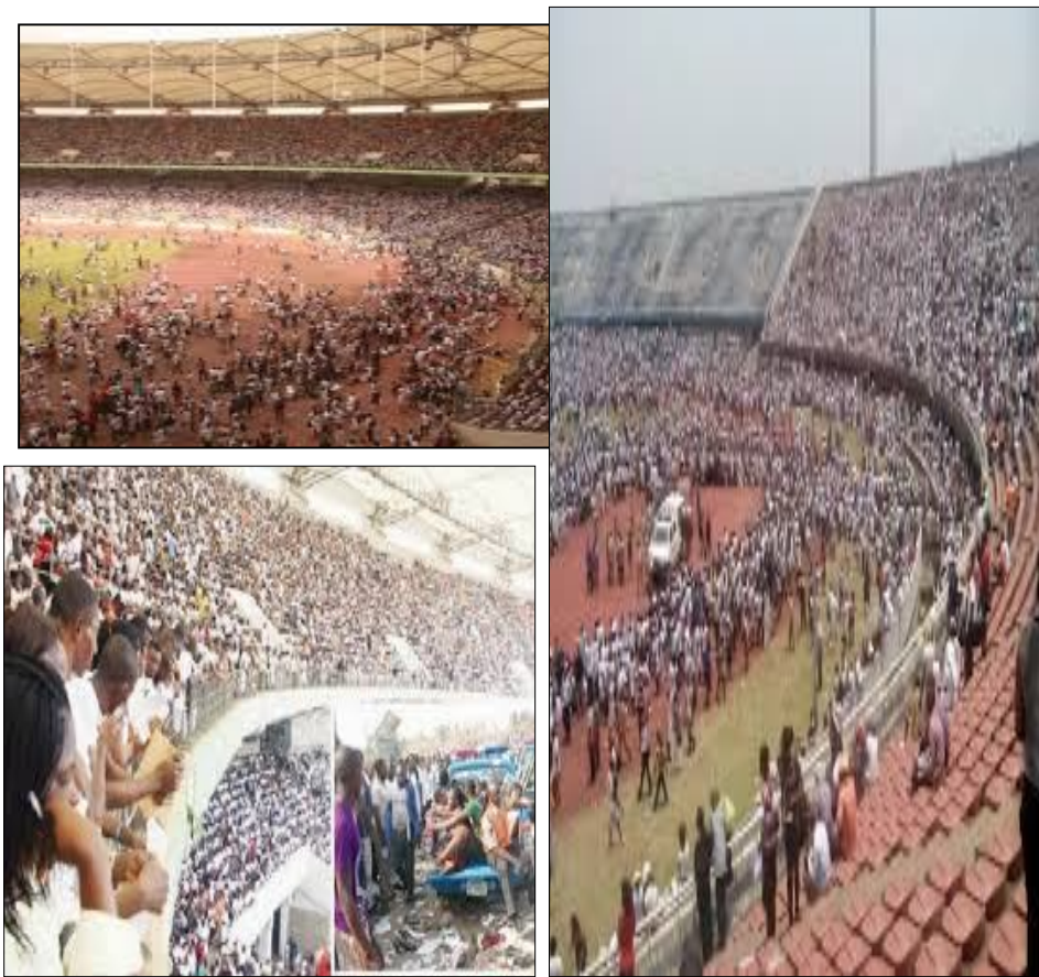
Figure 1: Nigeria Immigration Service Staff Recruitment Exercise, March 15, 2014