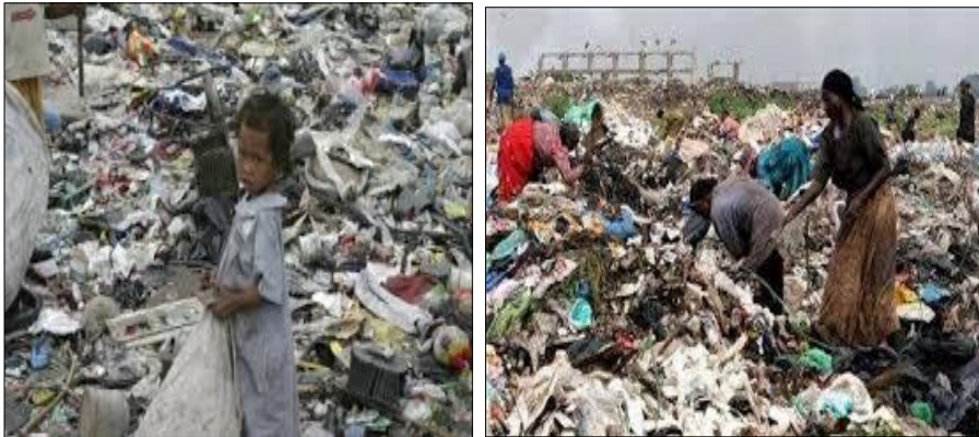
Figure 3: Heaps of Refuse with Scavengers