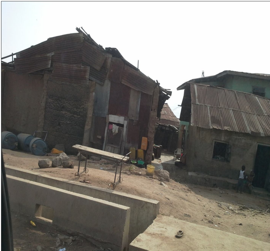
Figure 2: Dilapidated Houses In Abeokuta, Ogun State Capital, July, 2014